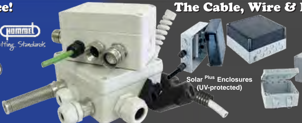
Solar Plus Enclosures (UV-protected)