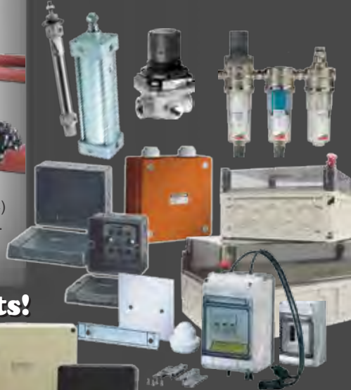
NEW Solar Enclosures

Materials: Polycarbonate, ABS, EMI, Polyester, Polystyrene, Aluminum, Powder-coated Steel, Stainless Steel. Features: Square/rectangle shape, Solid & transparent lids, PG/Metric Knockouts or Smooth Walls, Flanges, Extension Frames, Hinges & Latches. Applications: Indoor/Outdoor, Medical, Offshore, Marine, Wi-Fi, Hazardous Areas, Solar, etc.