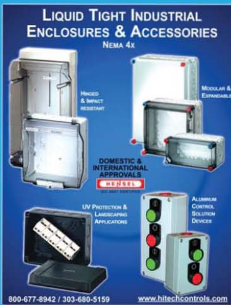
Polycarbonate / Polystyrene & Aluminum Enclosures