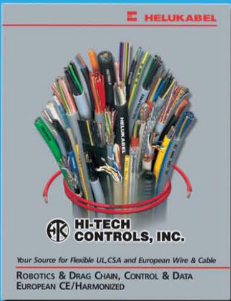
European / Domestic Cable