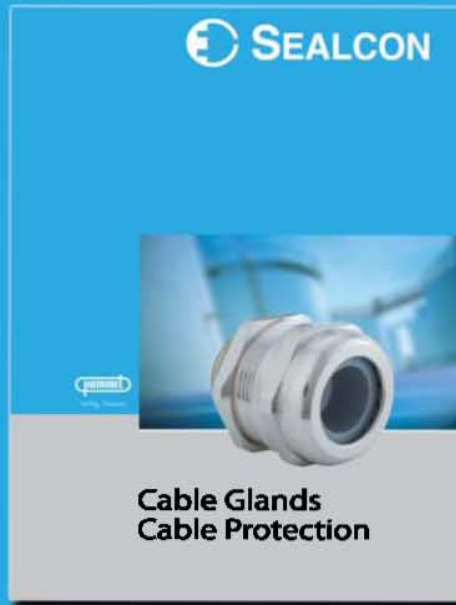
Cable Glands Cable Protection