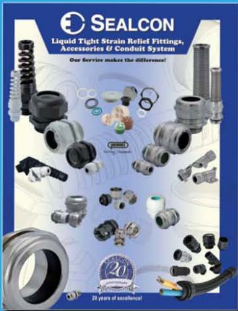
Liquid Tight Strain Relief Fittings, Conduit Fittings & Accessories