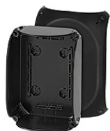
KF 1000 C

"Weatherproof" for outdoor installation, box walls without knockouts